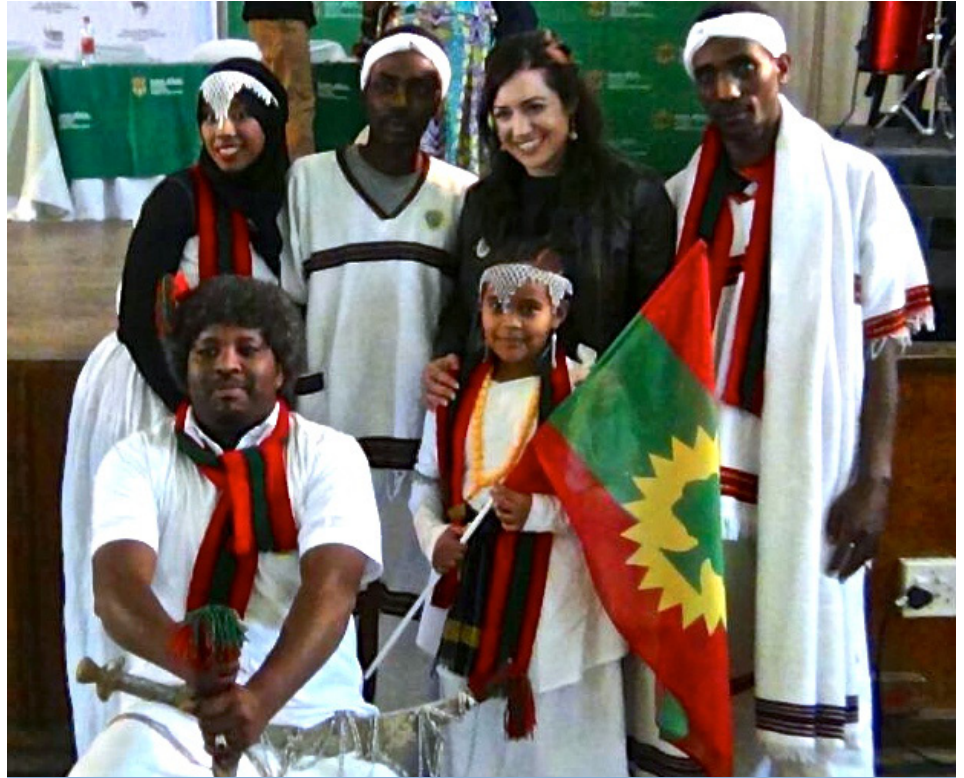
World Refugee Day celebrations in South Africa, with members of the refugee community

Despite both international and domestic legislative guarantees, however, refugees and asylum-seekers in South Africa often face extreme hardships. The social fabric