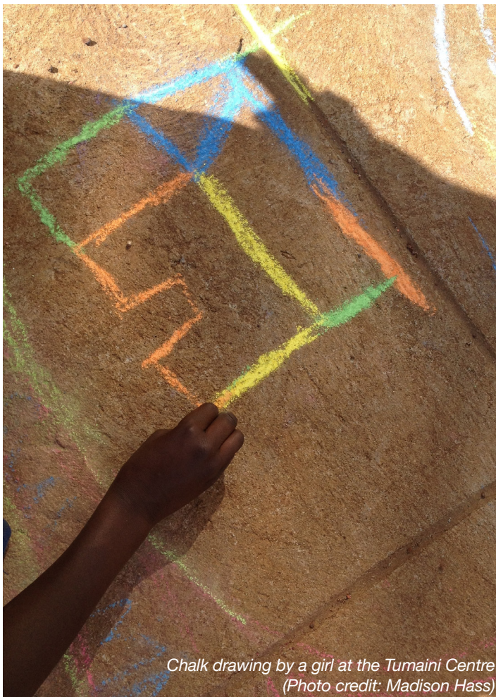
Chalk drawing by a girl at the Tumaini Centre

While I enjoyed my work in the field, the most rewarding part of my internship was my time spent with the girls at Tumaini. The 26 girls at the centre were some of the most resilient and inspiring individuals I have ever known. I quickly began to spend all of my Saturdays with the girls at Tumaini. My Saturdays with the girls were very fulfilling, as I witnessed the girls relax and enjoy life. We played tag and decorated the Tumaini courtyard with coloured chalk. The girls were particularly fond of my long hair and I spent many days simply sitting in the shade, talking to the girls as they braided my hair. Many of these girls shared memorable goodbyes with me in person and in letters. Even though my letters are now gone, the memories of the time I spent with these remarkable girls will live on with me forever.