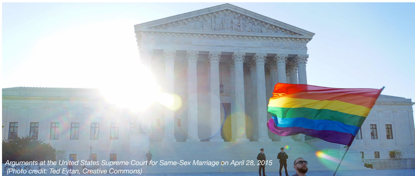
Arguments at the United States Supreme Court for Same-Sex Marriage on April 28, 2015