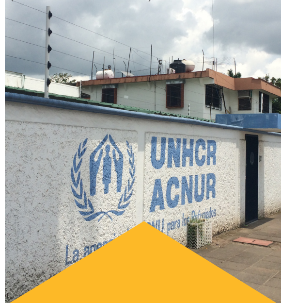
UNHCR Offices in Tapachula, Chiapas, Mexico