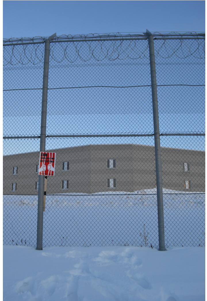
Central East Correctional Centre in Lindsay, Ontario

The system that administers this detention regime is broken. While in theory it is the Crown that has to justify continued detention at monthly detention review hearings, the decision-maker cannot depart from previous decisions to detain without “clear and compelling reasons.” This shift of the evidentiary burden and the reverse onus means that the longer you spend in jail, the harder it becomes to show that you should be released. Canada is something of an outlier in this regard. In the United States