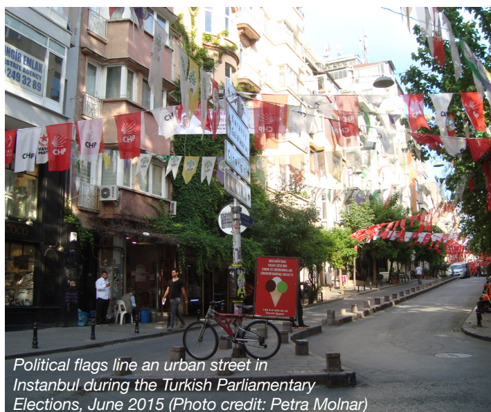
Political flags line an urban street in Istanbul during the Turkish Parliamentary Elections, June 2015

What remains clear is that refugee crises are inherently political, because they force the nation state and its citizens to re-examine issues of belonging, nationality, and citizenship. In a fluid and shifting world where the mass flows of people can arrive at state borders overnight, it is imperative to think about how the politics of managing migration allow certain "welcome" people in, while keeping others out. For Canada, it remains to be seen whether the Syrian crisis be more than a hot-button political issue and whether durable solutions and sustainable policies will be implemented to deal with the massive scale of human suffering experienced by millions of people.