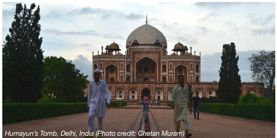
Humayun's Tomb, Delhi, India

Foreigners can play an influential role in conceiving human rights initiatives, but in order to ensure that the needs of the affected communities are addressed in the most appropriate and effective manner, local actors need to have a key role in these initiatives. To achieve the best possible outcomes for affected communities, there may be certain areas of human rights advocacy where the involvement of foreign lawyers and activists is not appropriate. In the context of the right to health, Lawyers Collective advocates that this is the best way to ensure that the highest attainable standard of health will be reached.