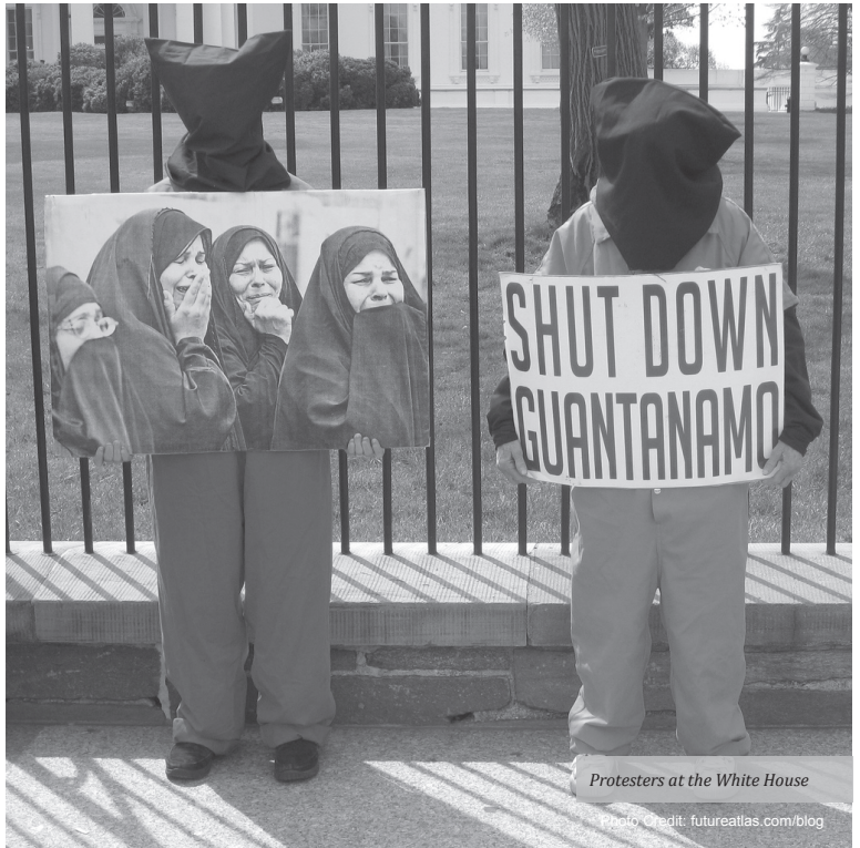
Protesters at the White House

When asked where these trials should take place, Prasow strongly advocated for the use of existing mechanisms – such as domestic civilian courts – to prosecute alleged terrorists. In Prasow's estimation, there is "no absence of legal authority over transnational actors" such as terrorists, given that their crimes are committed "in territories of states and against citizens of states" – contrary to what some scholars would have us believe.