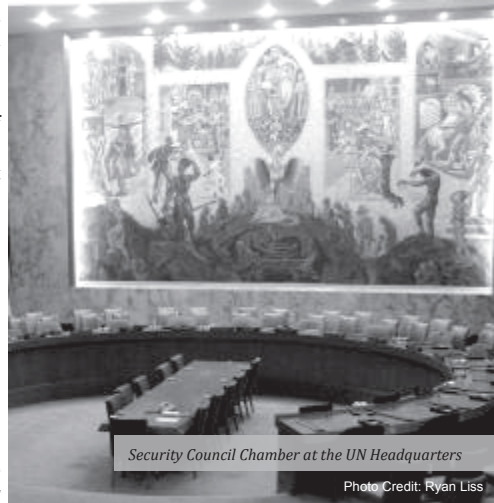
Security Council Chamber at the UN Headquarters

Starting today, Canadians must demand that our elected representatives rise above divisive party politics and the current government's preoccupation with domestic policy to regain our nation's position as a nation worthy of respect by our peers. ♦