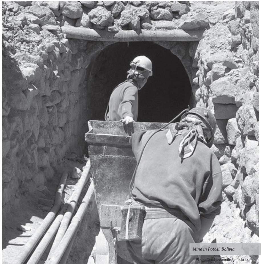
Mine in Potosi, Bolivia