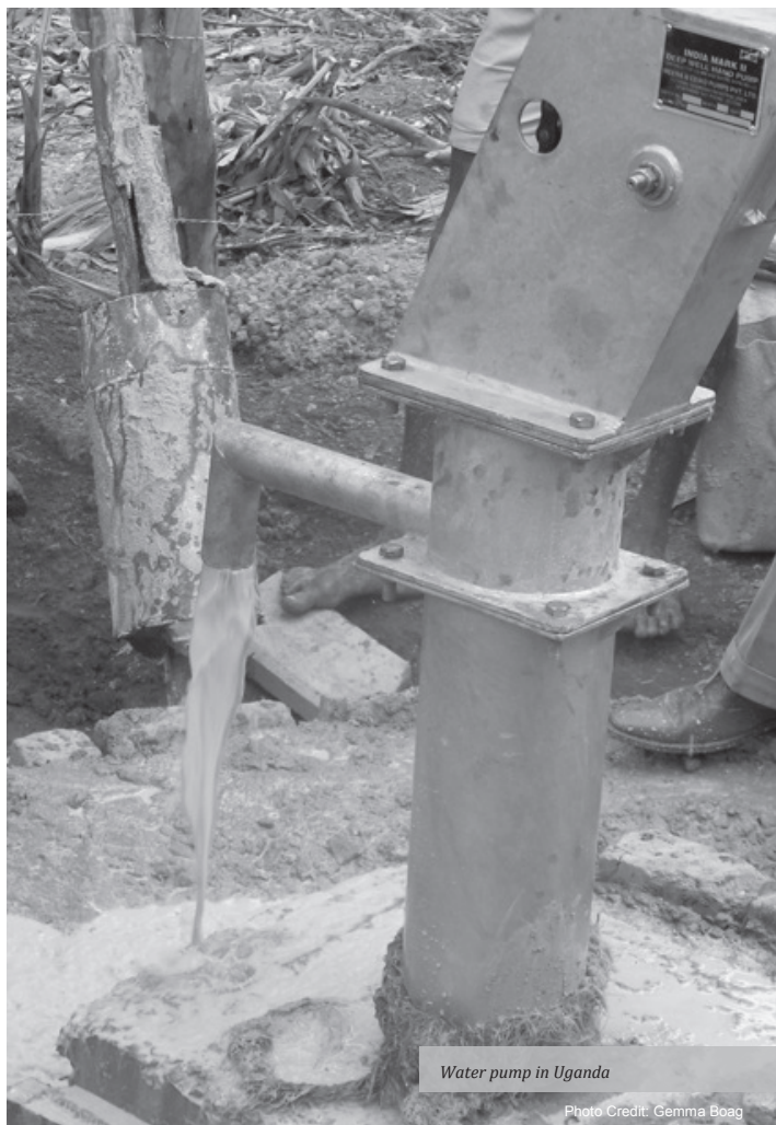
Water pump in Uganda

The right to water is a "positive" right. As outlined in South Africa's constitution, "the state must take reasonable legislative and other measures, within its available resources, to achieve the progressive realization of each of these rights". Thus, the declaration and recognition of the right to water does not imply that every citizen is guaranteed immediate access to a clean water supply. Moreover, the normative content of the right is still open to interpretation. The World Health Organization sets the basic need for water at 20L per person per day. To put that in perspective, the average Canadian uses 329L per day. South Africa's basic water policy grants each citizen 25L of free water per day, or 6kL per month. Citizens have contested this amount, along with the installation of pre-paid water supply metering systems ( Mazibuko v. City of Johannesburg ). Cases like this demonstrate that despite international recognition of the human right to water, the normative content of this right will continue to be debated at the national level. The challenge of implementation looms.