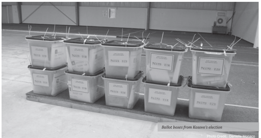
Ballot boxes from Kosovo's election

In the aftermath of NATO's 1999 military intervention in Kosovo, the UN Security Council adopted Resolution 1244, which sanctioned the UN Mission in Kosovo (UNMIK). After nine years of UN administration, the settlement process was considered a stalemate. On February 17, 2008, the Assembly of Kosovo unilaterally declared independence from Serbia. Subsequently, and following Serbia's request, the General Assembly referred the following question to the ICJ: "Is the unilateral declaration of independence [(UDI)] by the Provisional Institutions of Self-Government of Kosovo in accordance with international law?" The Court concluded that the adoption of the UDI did not violate general