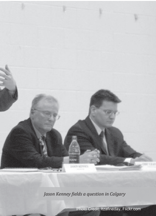
Jason Kenney fields a question in Calgary

The government's approach in the proposed legislation does not square with the real causes of migration or with Canada's international legal obligations. In the first place, the idea that there is a "normal application process" for asylum-seekers is largely a myth. Very often, the only way an asylum seeker can gain protection is by getting smuggled out of or into another country. This is done out of fear and desperation, not out of some desire to "jump the queue." Canada also has a legal obligation to accept refugees who arrive illegally. Article 31(1) of the International Refugee Convention prohibits Contracting Parties, like Canada, from imposing "penalties, on account of [a refugee's] illegal entry or presence." This is because the Framers of the Convention were well-aware that asylum seekers would often have no choice but to use any means, legal or not, to escape persecution. Bill C-49 clearly runs afoul of this prohibition and penalizes asylum-seekers who themselves are forced to rely on smugglers to stay alive. Human smuggling is indeed a problem, but the solution does not lie in punishing the people smuggled. The real solution lies in addressing the humanitarian conditions that have compelled people to risk their lives to come to Canada. ♦