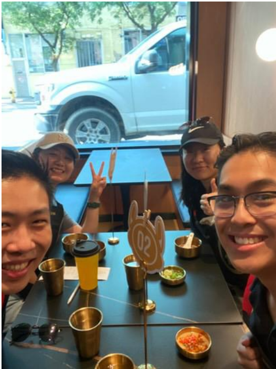
A photo of me and the other law students at the clinic getting hotpot as our farewell dinner