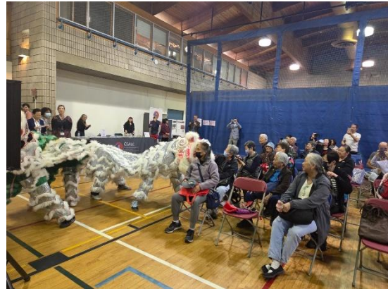
Our booth seen at the Asian Heritage Month Celebration in Toronto on May 30, 2025