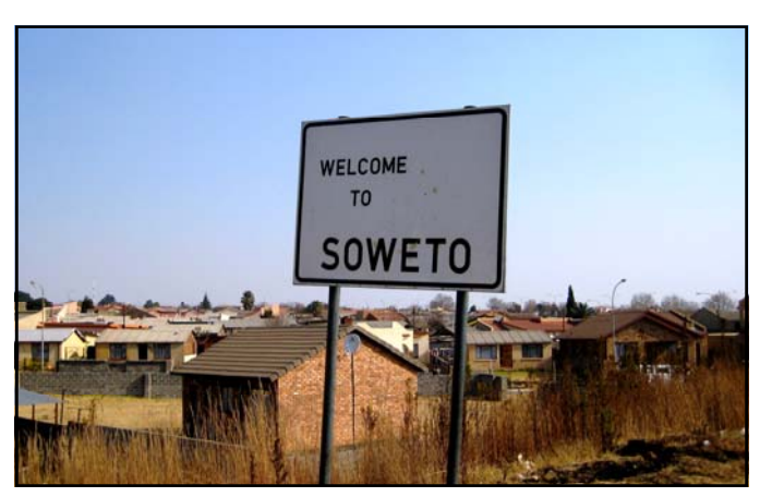
South Western Township, Johannesburg

Within this context, Urban Landmark pursues the imperative to make [CONTINUED ON PAGE 11]