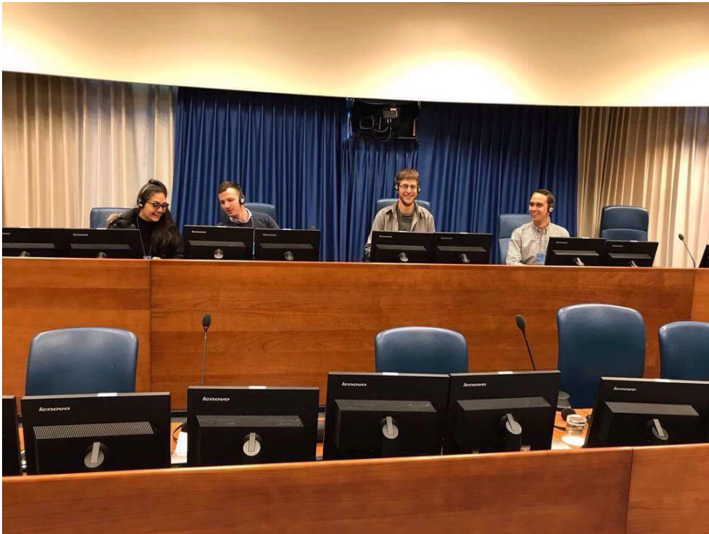
During a courtroom tour, a brief stint as Presiding Judge

Writing this now, just a few weeks from the coming school year, I am saddened at my pending departure. I have loved my time here in Europe. I made great memories and even greater friends this summer. For those considering applying for an IHRP Fellowship in future, I cannot recommend highly enough the MICT, the ICC, or any other international criminal tribunal. It is a remarkable experience.